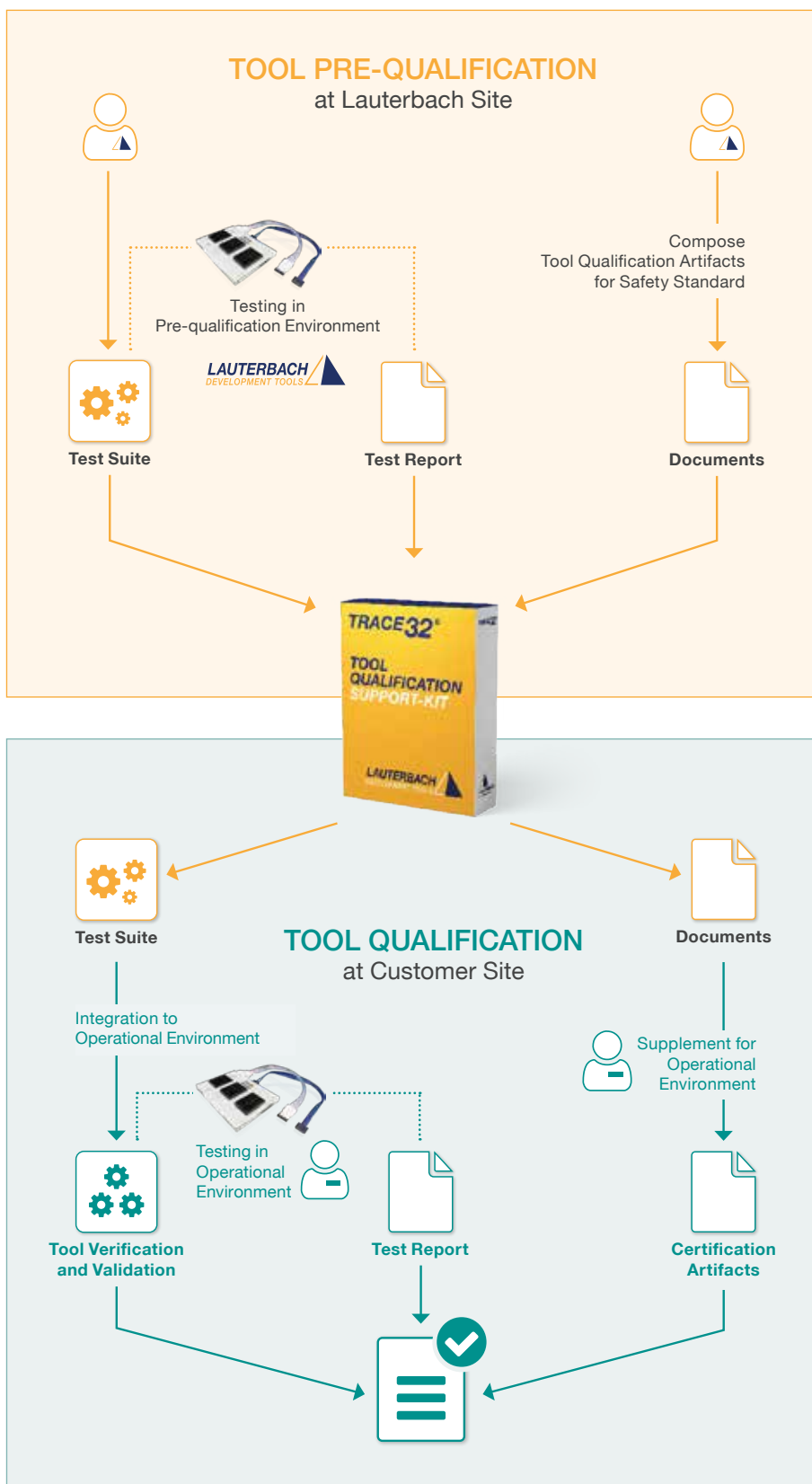
Figure 1: The 2-stage qualification process

DO-178C is a formal process standard that covers the entire software lifecycle – planning, development, and integral processes to ensure the correctness and robustness of software systems for civil aviation applications.