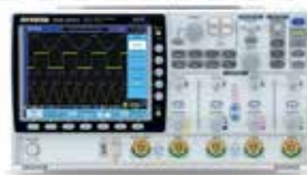
GDS-3000A Series 650MHz /350MHz BW, 2 Input Channels, 5-2.5GSa/S