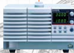
PSW-Series Wide Range Output DC Power Supply