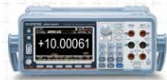
GDM-906x Dual Measurement Multimeter Vehicle Temperature Measurement and Monitoring Solution