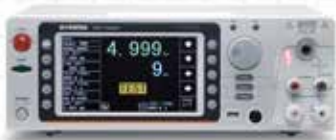
GPT-12000/9000 Series 200VA/500VA Safety Analyzer