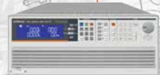
AEL-5000 Series 22.5kW High-performance AC/DC Electronic Load