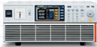
ASR-2000/ASR-3000 Series 500VA-4KVA AC/DC Power Source